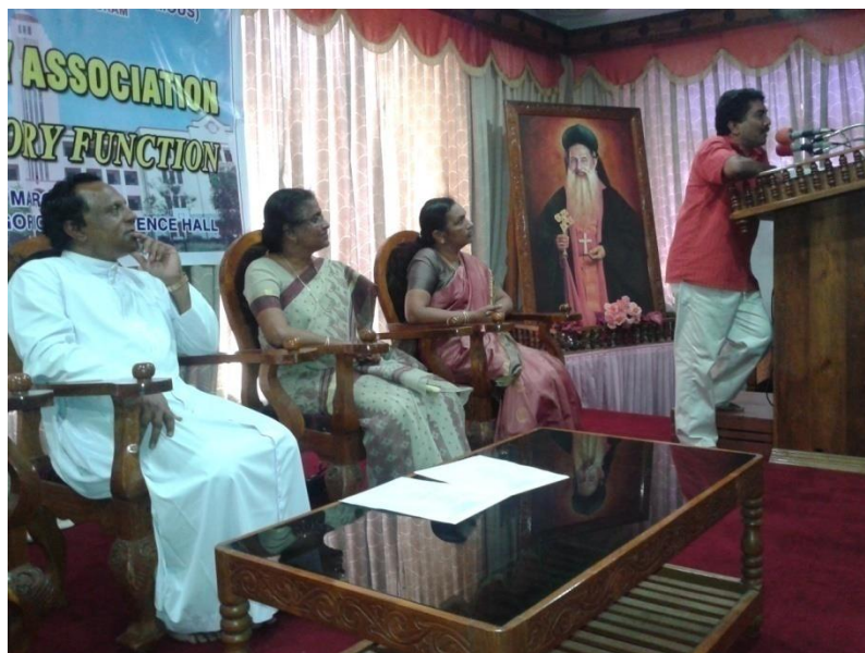
Chemistry Association Valedictory function 17-03-2015