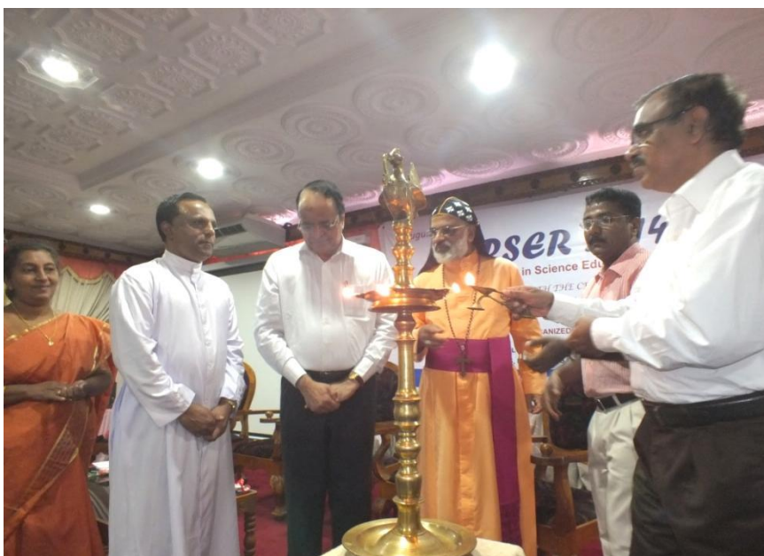
Inauguration of APSER 2014 at Mar Ivanios College, Thiruvananthapuram