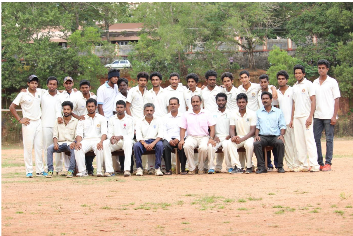
Mar Ivanios Cup Basketball 2014-15 in action